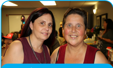
Staff Appreciation Day