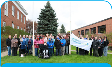
Flag Raising, Town Hall.