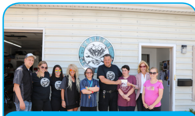
Scotty's Cycle Fundraiser