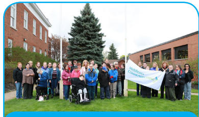
Flag Raising, Town Hall.