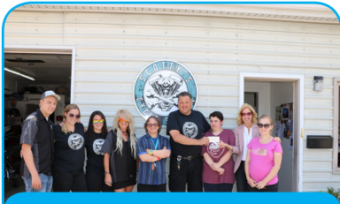
Scotty's Cycle Fundraiser