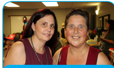
Staff Appreciation Day